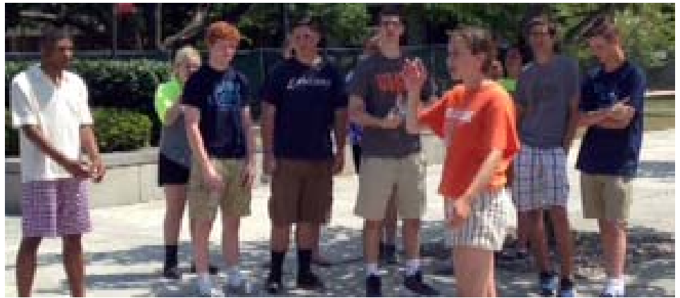
St. Mary's students receive a tour of Syracuse University.

During each college visit we learned about the hundreds of majors, study options, and research opportunities available. There was a very wide variety of resources to ensure the prosperity of the students. Along with academics, a broad spectrum of athletic programs including varsity and intramural teams were available. Also, each college had a strong sense of community and value of diversity. These colleges offered numerous fraternities,