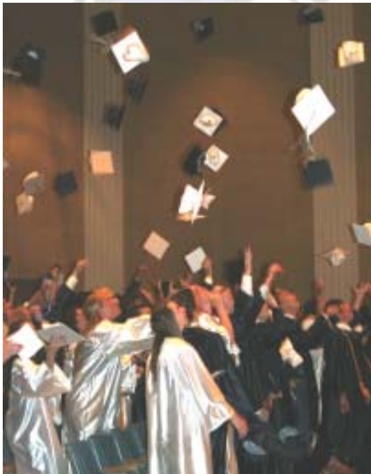
The Class of 2013 celebrates.