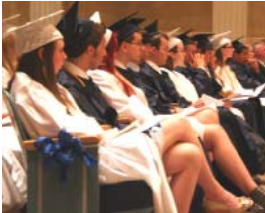
Listening to the speakers.

Photos from the 109th annual Commencement Exercises