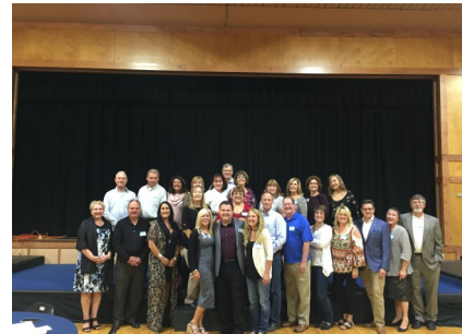
The Class of 1977