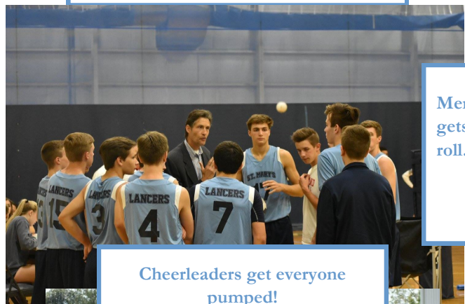
Men's Volleyball gets ready to roll.