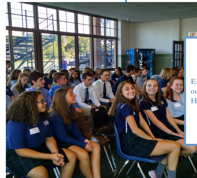
Eager tour guides at our annual Open House