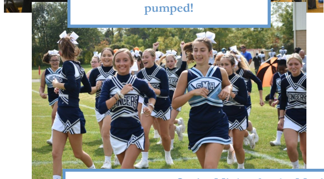
Cheerleaders get everyone pumped!