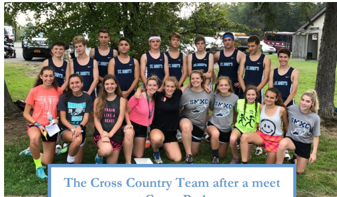
The Cross Country Team after a meet at Como Park.