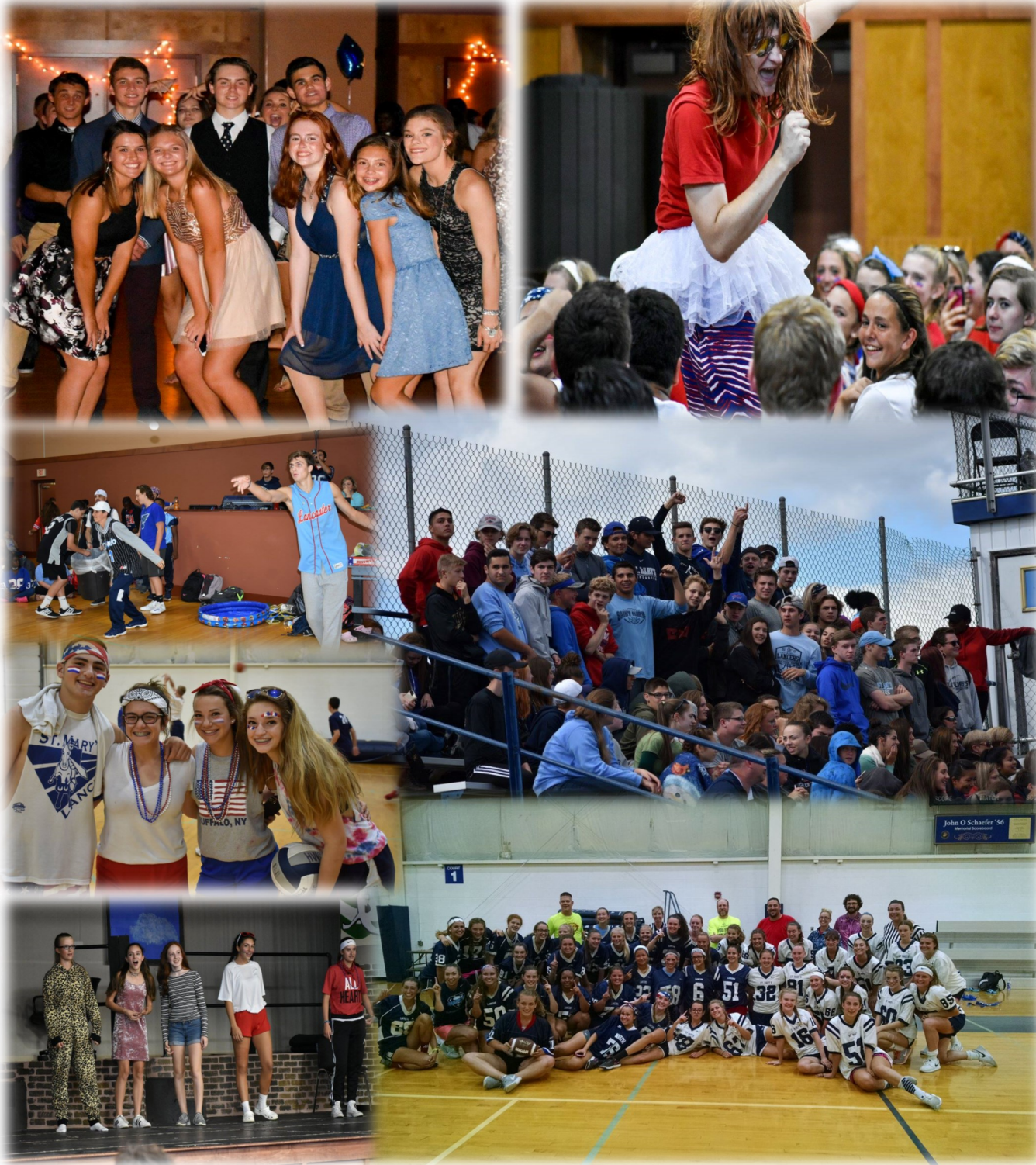
For even more SMH photos, make sure to follow us on Facebook (St. Mary's High School, Lancaster NY)! We post a weekly photo album of all the exciting things happening at our school!