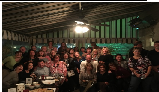
The Class of 2007

The Class of 2007 also took part in St. Mary's Homecoming Weekend, with their Friday gathering at Bobby J's and a Saturday afternoon at the Lancer football game.