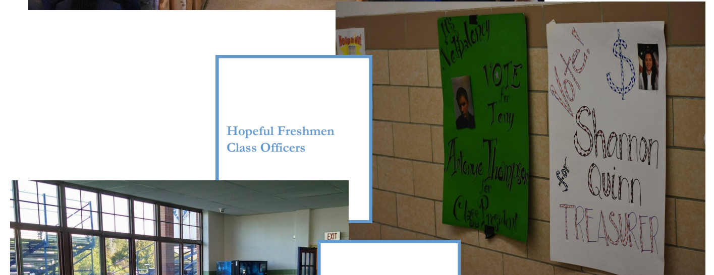
Hopeful Freshmen Class Officers