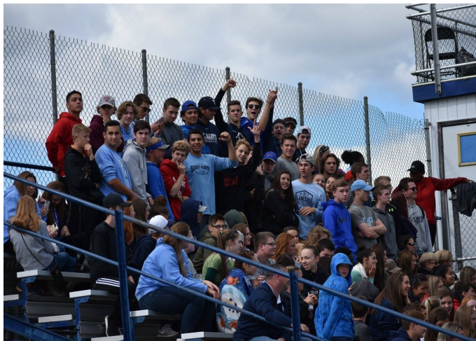
The student section is ready to go at the Homecoming Game