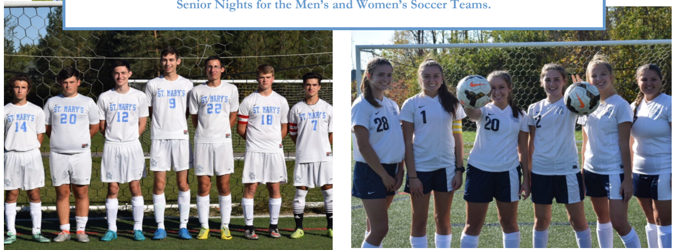
Senior Nights for the Men's and Women's Soccer Teams.