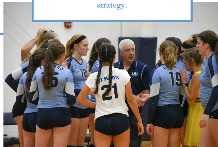
Women's Varsity Volleyball talks strategy.